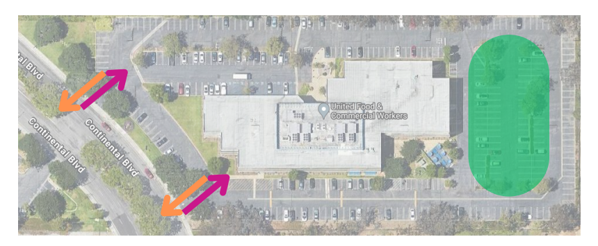
550 Continental Ave

Parking Entrance Parking Exit Parking Area